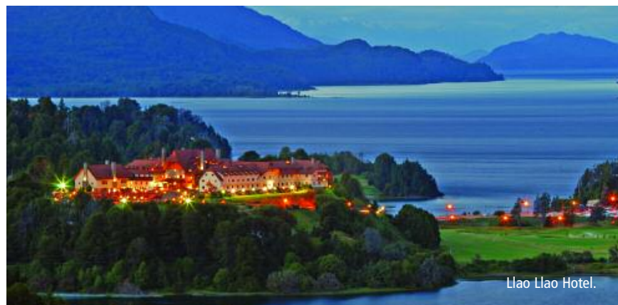
Llao Llao Hotel.

Enjoy a round at Llao Llao Golf Club. The course is surrounded by the Nahuel Huapi and Moreno Lakes, mountains and forests. After