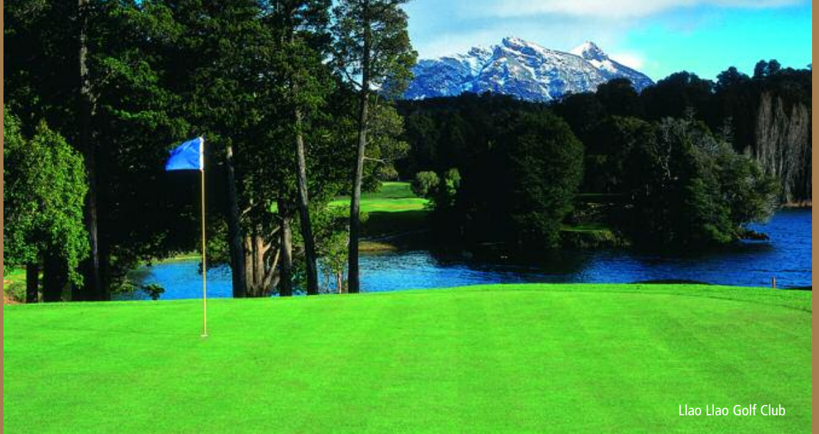
Llao Llao Golf Club