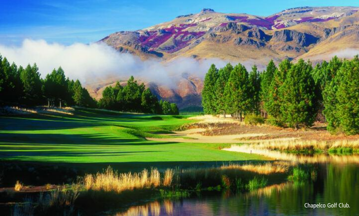
Chapelco Golf Club.