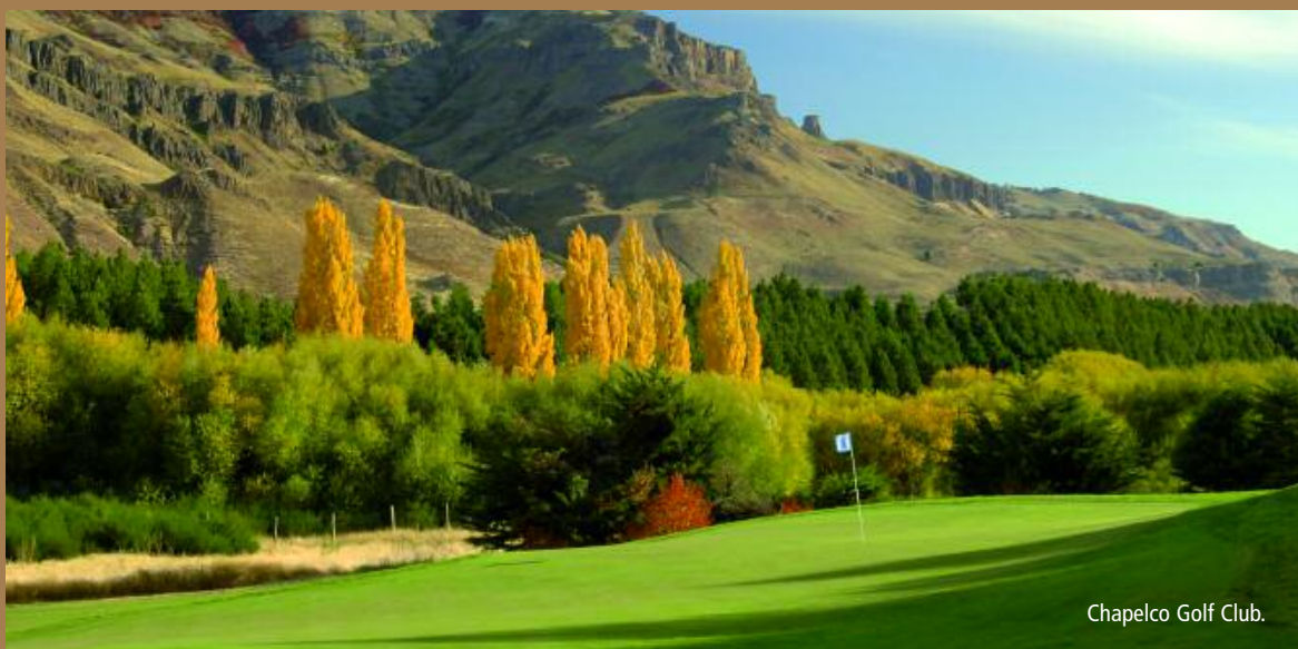
Chapelco Golf Club.

We guarantee that the holiday price quoted to you when you pay your deposit is the holiday price you will pay. We have taken steps to avoid any possibility of surcharging our clients for currency fluctuations and any other holiday cost.