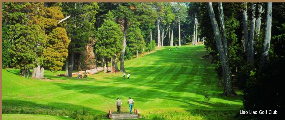
Llao Llao Golf Club.

Buenos Aires is the capital. It is a smart city bursting with energy. And while the gaucho is still celebrated, Argentina is a more cosmopolitan country than its neighbours. From the country that brought the world the tango, the people have an admirable lust for life – whether it’s for food, dancing, partying or football! Outside of Buenos Aires, nature takes the lead and there’s a jaw-dropping view around every corner.