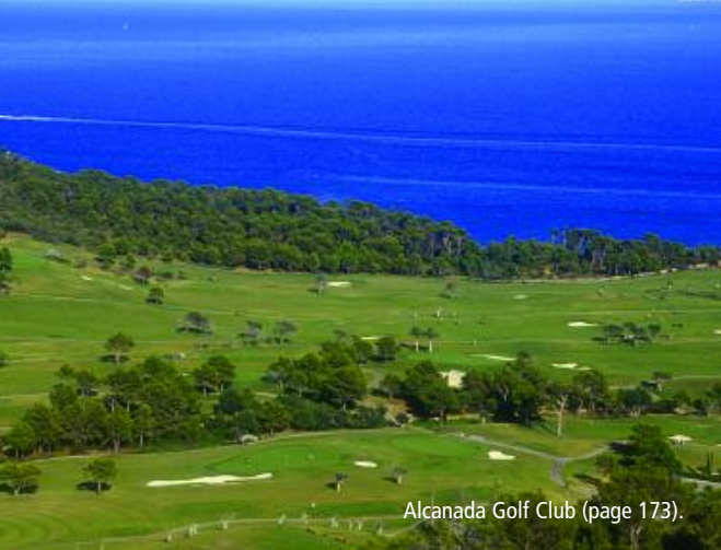
Alcanada Golf Club (page 173).