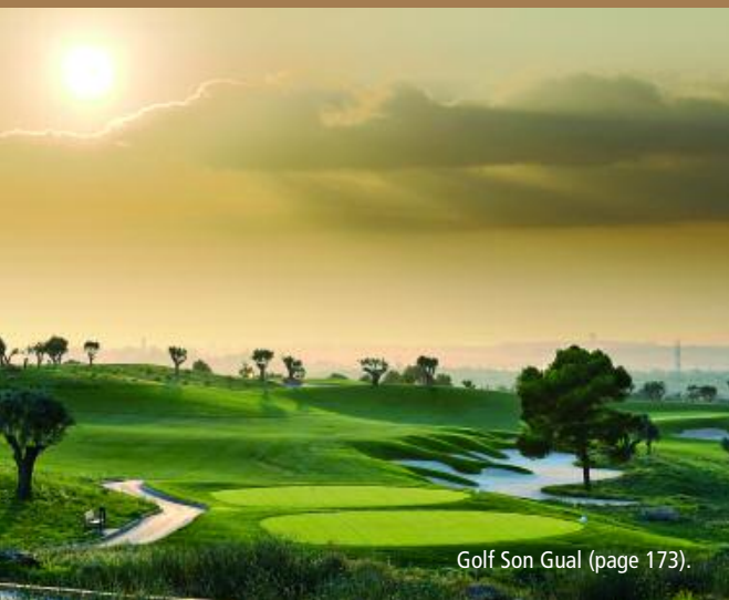
Golf Son Gual (page 173).