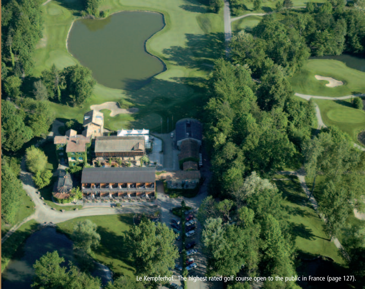
Le Kempferhof...The highest rated golf course open to the public in France (page 127).